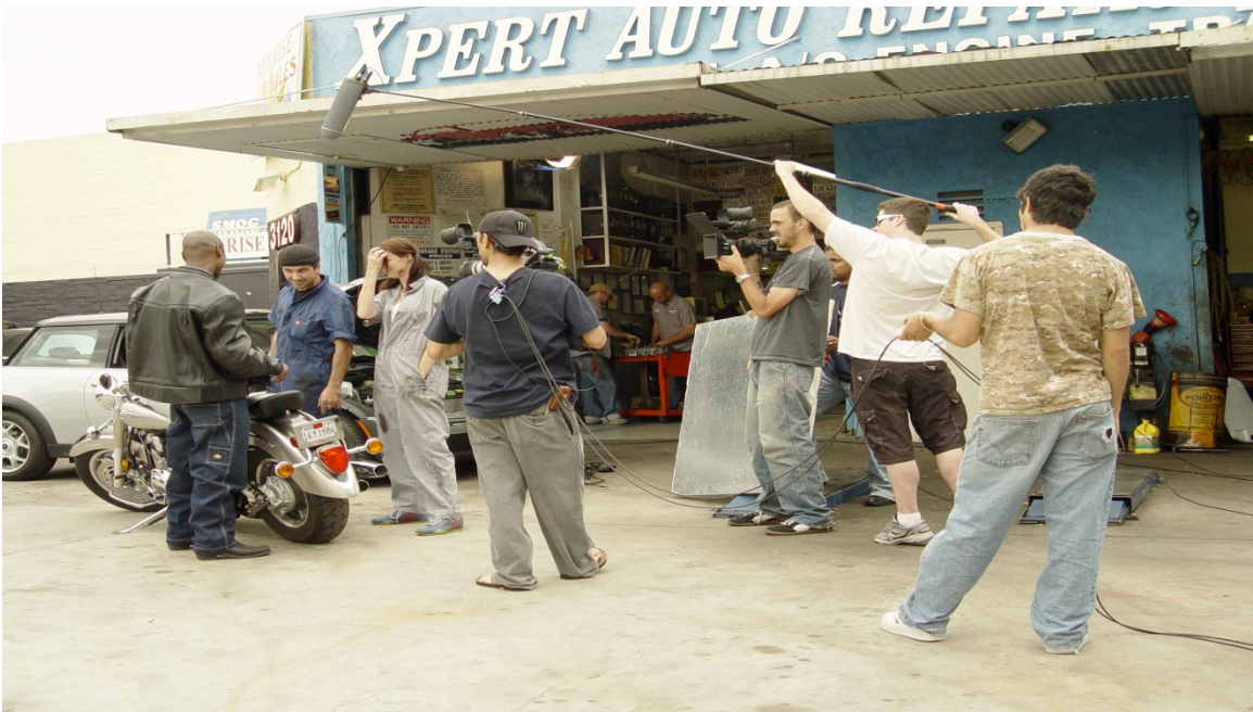
On Set with the STARTING FROM SCRATCH team